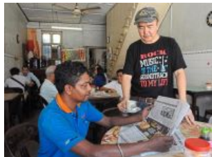
Famous coffee shop to be restored