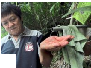
No more splashing fun