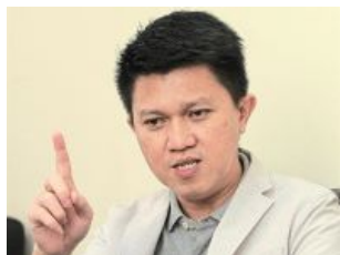
Milestone for MCA Youth Public Speaking Club