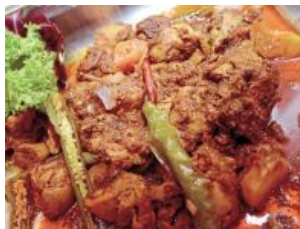
Peranakan and Portugese dishes the stars in hotel's buffet line-up