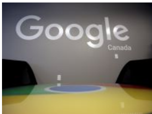
Google wins some, loses some in global antitrust battles