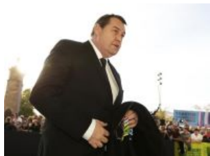
Tuipulotu commits to NZ Rugby until after 2019 World Cup