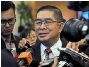
Plans for Mantanani island