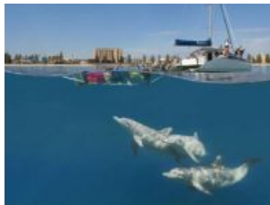
If you want nature and adventure, visit Adelaide