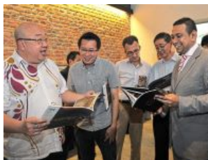
Best of business and leisure